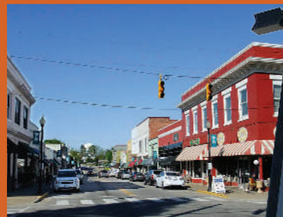
A view of Salem Street looking Northward