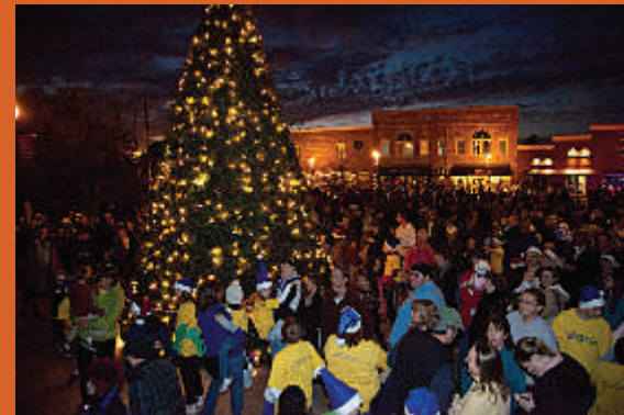
Lighting of the Downtown Christmas Tree

Downtown Apex is a unique assortment of award-winning restaurants, specialty shops and boutiques, bakery and ice cream shops, salons, spas, and professional services—all within a 1-mile walk. It's a great place to spend a relaxing day or evening shopping, strolling, and dining. If you're lucky enough to be in town for a festival, you'll see why people from all over the country make the trip to attend our hugely popular events. Downtown Apex is a key reason that Money Magazine named Apex the #1 Best Place to Live in 2015.